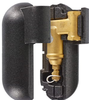
TUR100V INSULATION SET