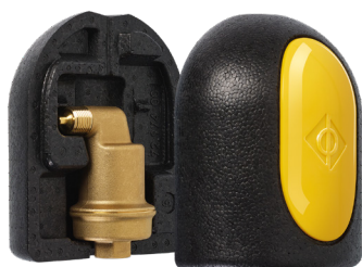
TAB050 INSULATION SET

Spirotech is equipping its deaerators and dirt separators with new, ready-to-install insulation sets in a new Spirotech design. This means that HVAC engineers are now able to comply with insulation standards for these components.