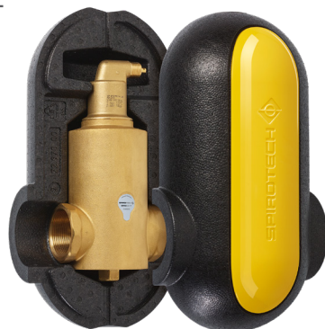
TAR200 INSULATION SET